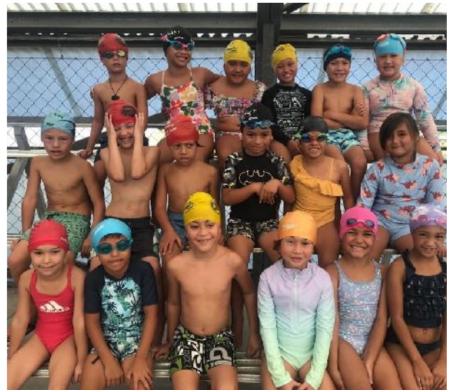
Ruatepūpuke ready to swim at Elgin pools