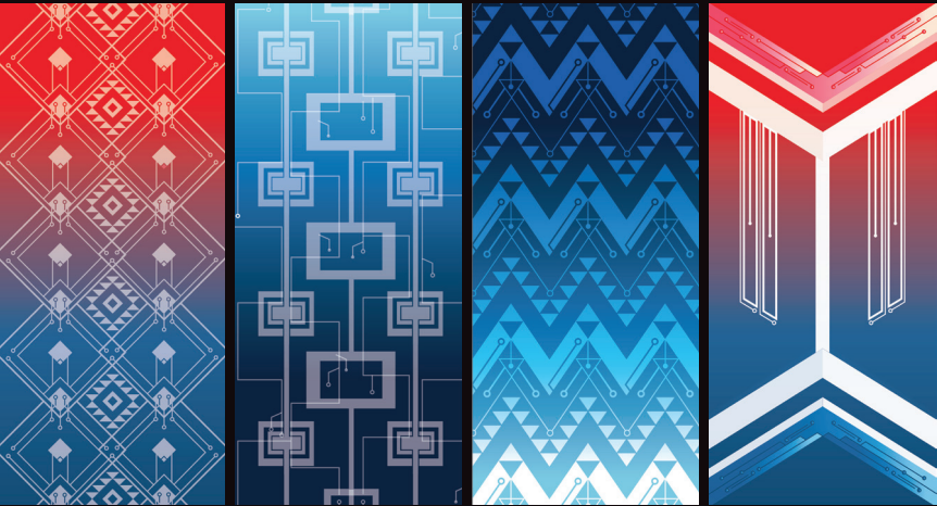
Tokaitūtanga Courageous This pattern the 'tokaitū' translates to founder and refers to a person who demonstrates the ability to be courageous. The Pūke or founder also represents rangatira, resilience and loyalty. Angitūtanga Curiosity This pattern is the 'Angitū' version of 'Pūke' and speaks to a person who demonstrates the ability to be curious. A person who wants to know and learn more. It represents exploration and way finding and an opportunity to reflect much like the time when he went in search of the three baskets of knowledge. Tāmirotanga Collaborative Known as 'Ara Moana' this pattern refers to a person who demonstrates the ability to operate in a 'collaborative' manner. It also represents alternative pathways or ways of completing a task and working together to create better relationships. Āhurutanga Compassionate 'Te Kōkoro o Pūke' is this pattern which speaks to a person who demonstrates the ability to be 'compassionate'. Someone who can provide safe and warm spaces to support others around them.

Keeping in touch daily and weekly is important. Every class has a Class Facebook page which is a window to your child’s learning programme and also a quick and easy way to connect with the kaiako. Pānui are sent home regularly and the school Facebook and website provide are the places to go for up to date information.