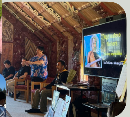
Our kaiako spent the morning at Whangara talking about Te Mataiaho - our new curriculum