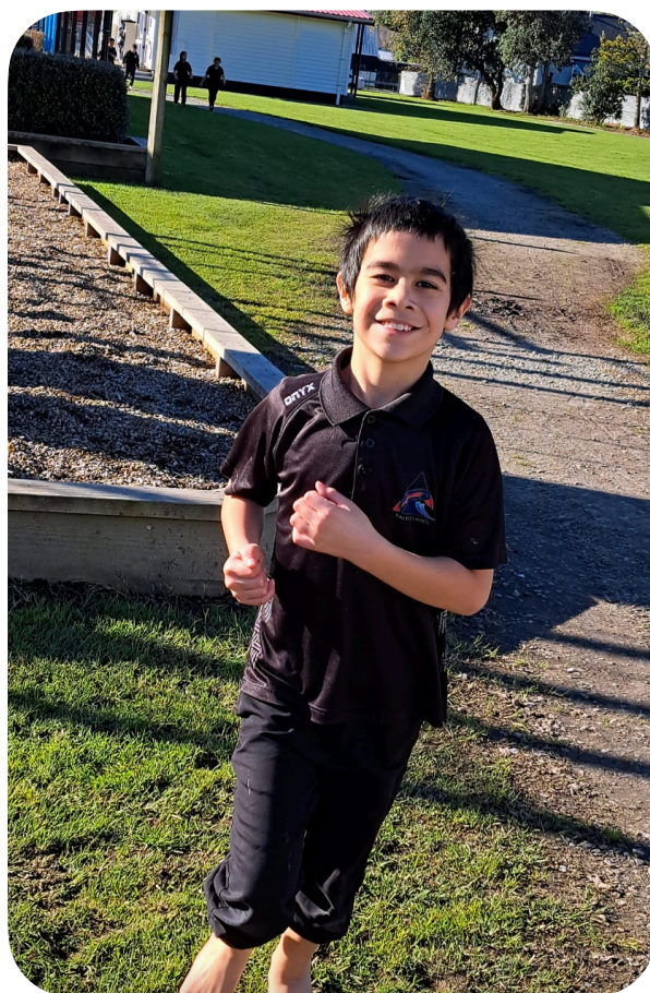
Rimini looking fit doing Cross Country training!