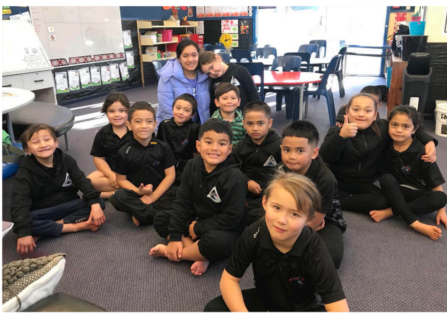
Welcome to Kōkā Kalo in Whare Kōrero

These are being taken on the 24th and 25th of August. Class and sports photos are being taken on the Thursday and whānau and individuals on the Friday. Look out for envelopes coming home soon.