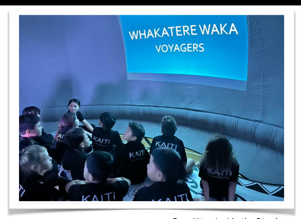
Rangiātea inside the Stardome

Kia Tū Maia, Kia Tū Pakari, Kia Tū Rangatira