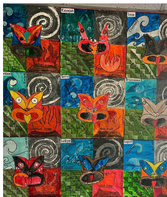
Rūaumoko art created by Rangiatea tamariki