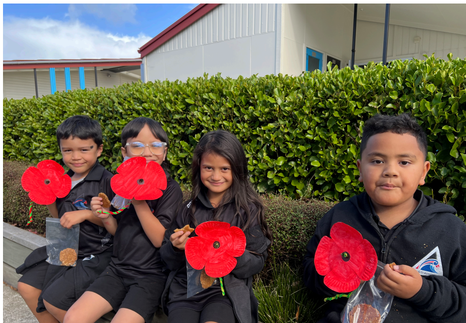
Whare Puawai Tamariki with their Poppies and Anzac biscuits