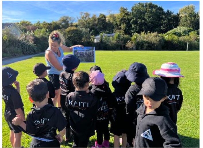
Back Field 2023

Updates @ Kaiti From this ..... to this ♥