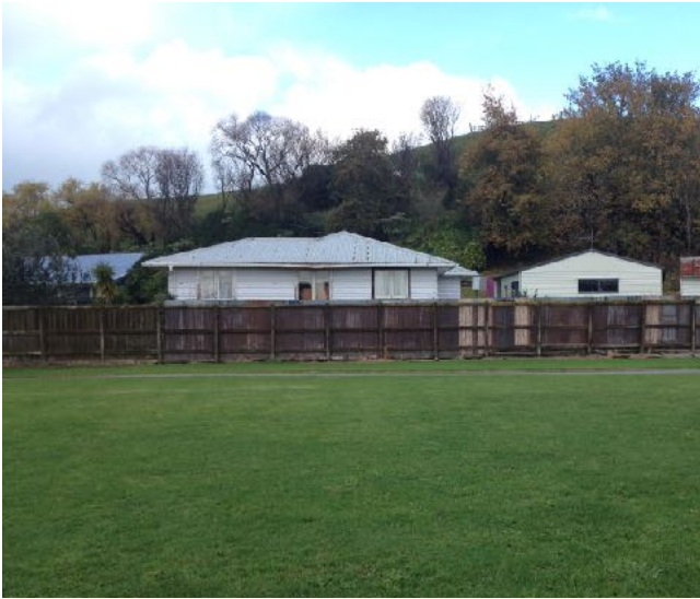
Back Field 2018