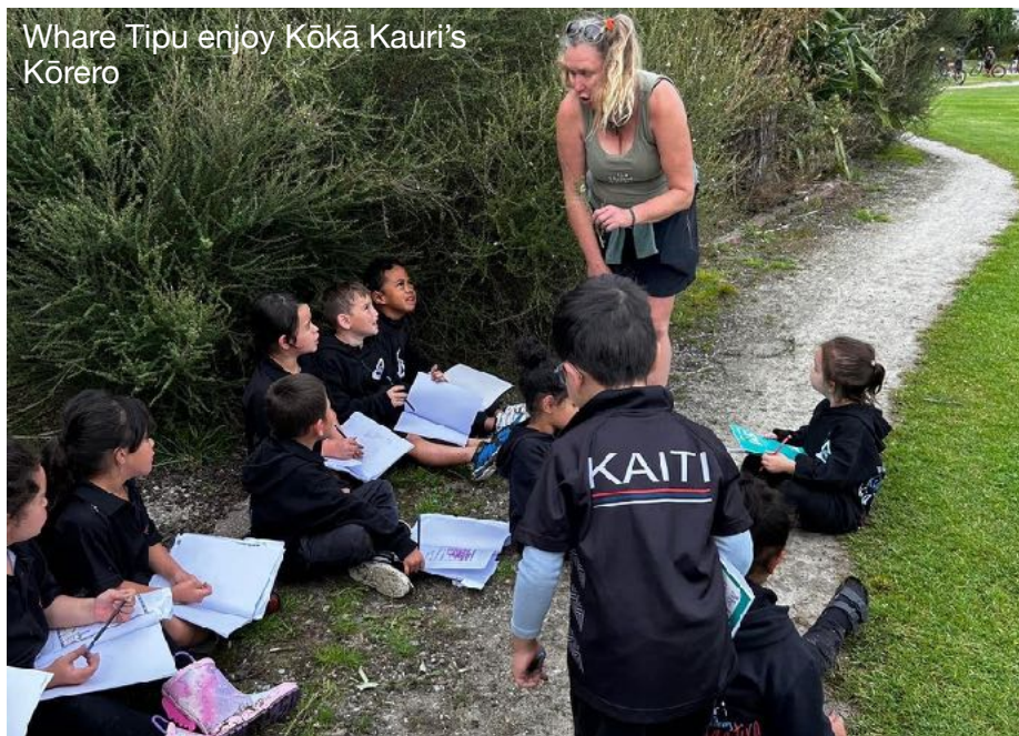
Whare Tipu enjoy Kōkā Kauri's Kōrero

have 100% attendance! Looking good for the mystery trip next week!