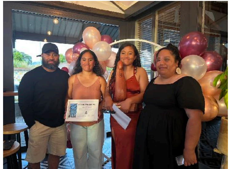
Tū Rangatira Year 8 Leavers Dinner