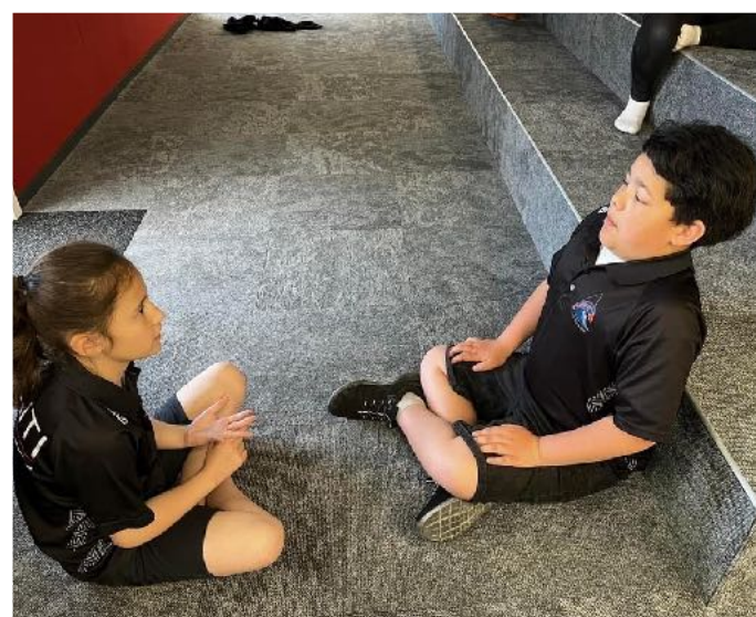
Tequila Rose and Judah practice Belly Breathing