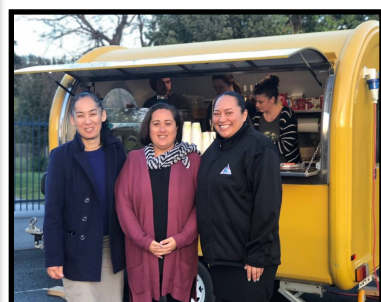
What a way to start the week... a free hot drink and a nice chat with our whānau.