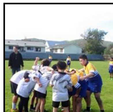
Our rugby boys played exceptionally well against Te Hapara last week.