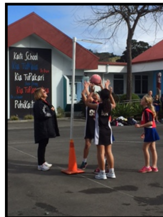
Our netball team playing Central on Friday. Another goal for Kaiti!

Last Friday, Kaiti School hosted 2 sporting events at school. Our netball team played Central and our rugby team played Te Hapara. Both teams played very well and won their respective games. Ka mau te wehi tamariki ma. This week our rugby team will be playing away from school at Te Kura Kaupapa Maori o Nga Uri a Maui and our netball team will be playing here at school against Mangapapa. Naumai haere mai whanau. It will be good to see you here at school or supporting our rugby team at Te Kura Kaupapa Maori o Nga Uri o Maui on Friday.